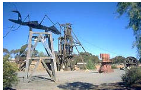
Pro Hart's giant ant sculpture in Rotary Park