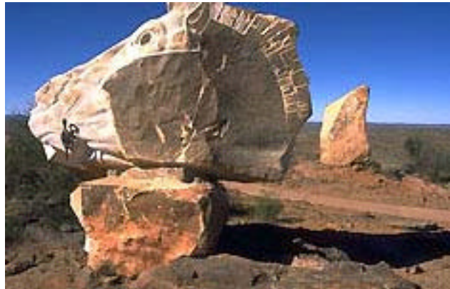
Wilcannia stone sculpture on the edge of the desert

The City Gallery has a pamphlet (also available from the visitor's centre) relating to the Living Desert Art Trail which takes you on a walk through the Living Desert Reserve, located on the northern outskirts of town along Nine Mile Road. Its 2400 hectares contain aboriginal sites, a regeneration reserve, panoramic views, a four-wheel drive track, a permaculture site, a range of flora and fauna and there are currently plans to set up an animal reserve for endangered species. In 1993 twelve international sculptors each worked on a huge Wilcannia sandstone boulder of their own without power tools for 14 hours a day, every day for 8 weeks. The results are still there for all to see. A book about the sculptures is available at the visitors' centre.